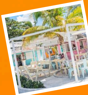
Grace Bay Market

In addition to the Shops of Ports of Call, there are four nearby shopping plazas within walking distance: Grace Bay Market, One Season Grace Bay, Saltmills Plaza, and Regent Village.